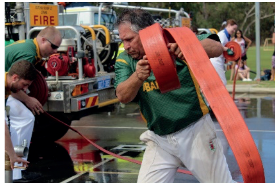
MOORA & ALBANY VOLUNTEER FIRE AND RESCUE SERVICES