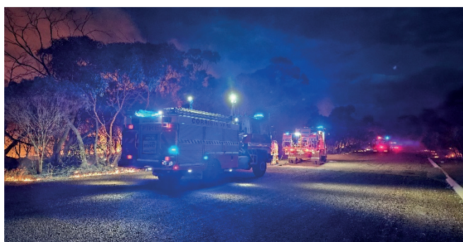
CORRIGIN VOLUNTEER FIRE AND RESCUE SERVICE

Brigades denoted with * are not financial members of the Association