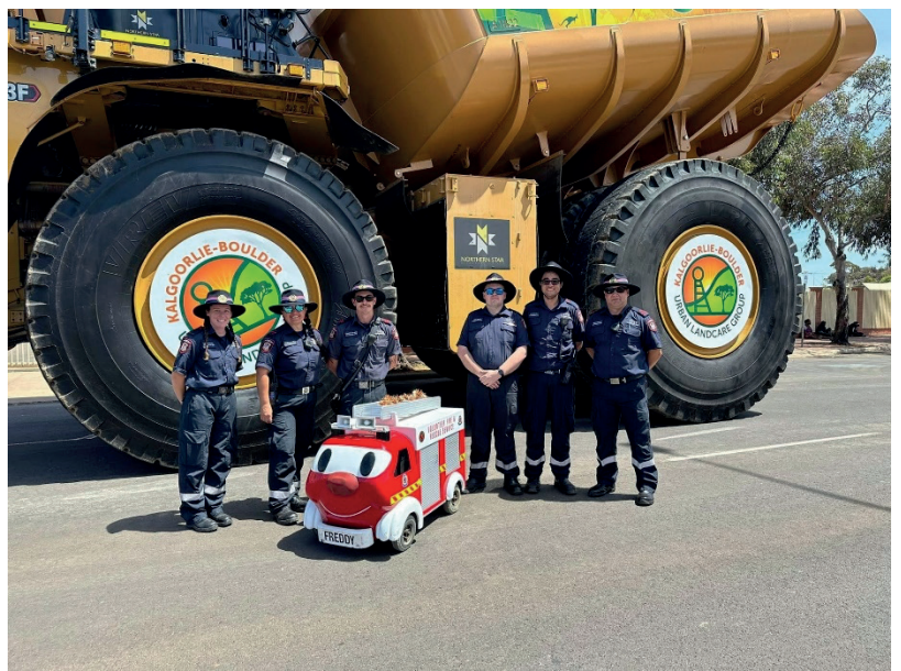
FREDDY AT PERTH CHILDREN'S HOSPITAL BURNS AWARENESS DAY/ WITH KALGOORLIE VOLUNTEER FIRE AND RESCUE SERVICE