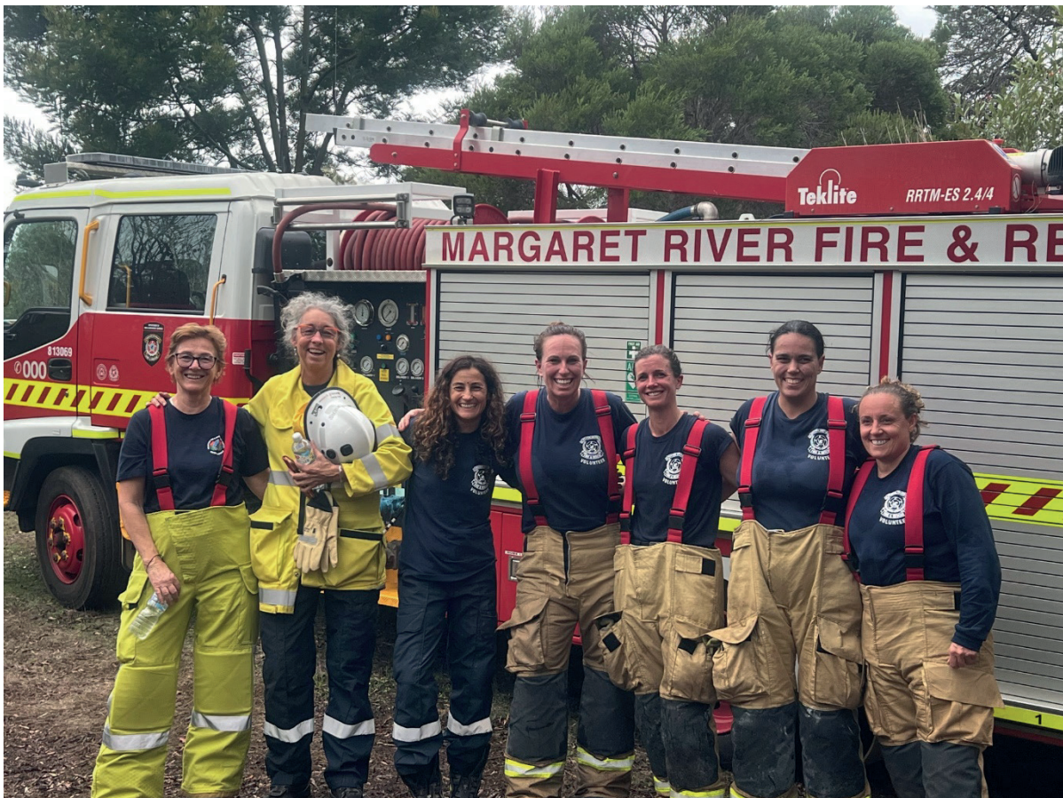
WALLCLIFFE, WITCHCLIFFE AND MARGARET RIVER VOLUNTEER FIRE AND RESCUE SERVICES