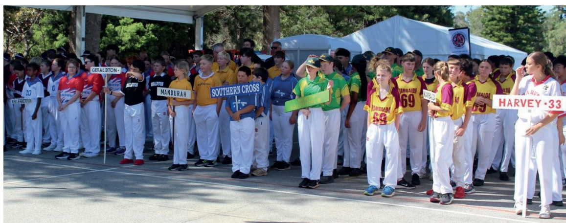
PARTICIPATING BRIGADES IN THE 2023 STATE JUNIOR CHAMPIONSHIPS