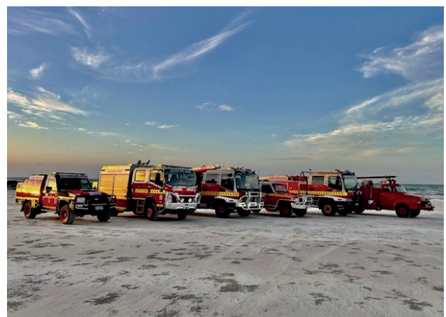
SOUTHERN CROSS AND BROOME VOLUNTEER FIRE AND RESCUE SERVICES