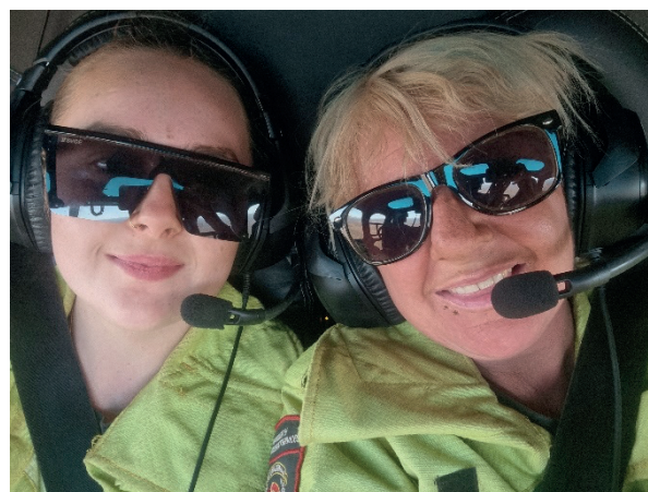
NORTHAMPTON/ COOLGARDIE VOLUNTEER FIRE AND RESCUE SERVICES