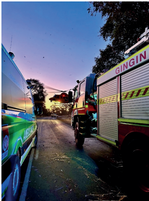
GINGIN VOLUNTEER FIRE AND RESCUE SERVICE