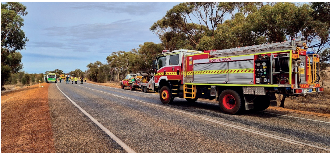
MOORA VOLUNTEER FIRE AND RESCUE SERVICE