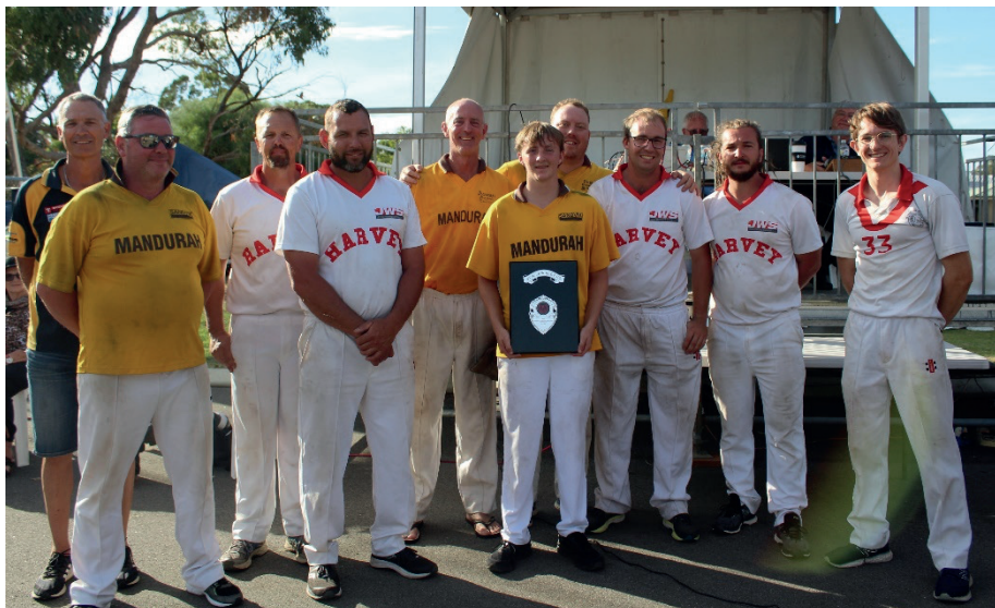
OVERALL CHAMPION BRIGADES – MANDURAH & HARVEY VOLUNTEER FIRE AND RESCUE SERVICES