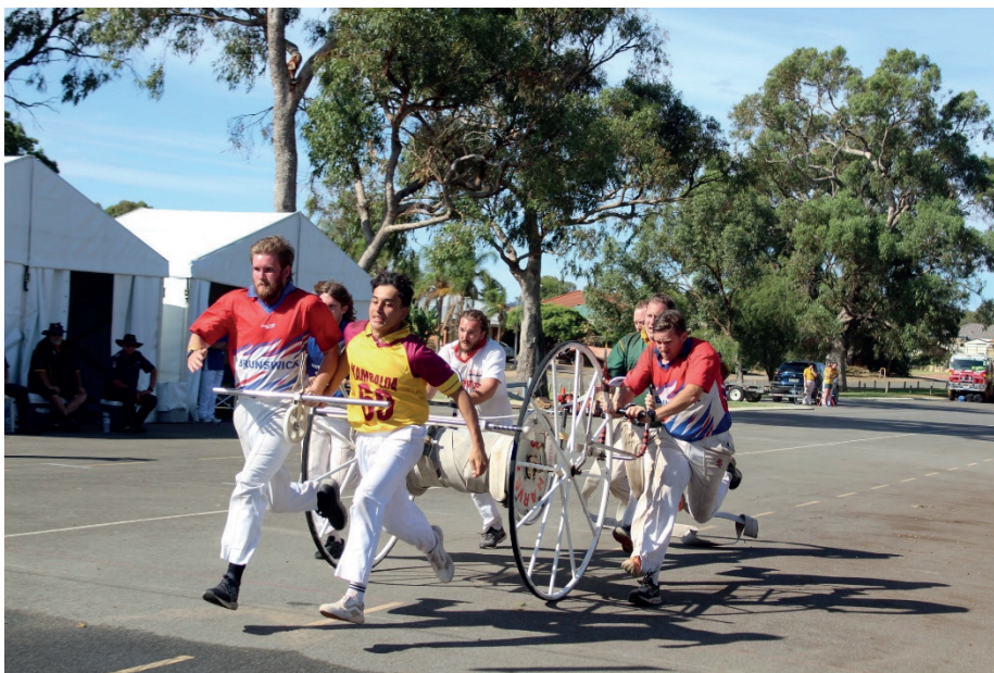
STATE EASTER CHAMPIONSHIPS AT BORTOLO PARK, GREENFIELDS

The Department of Fire and Emergency Services provide physiotherapists at all our major Championships to assist with the provision of treatment for new injuries and management of existing conditions. This has resulted in an increased awareness in injury prevention and management and has been an outstanding success.