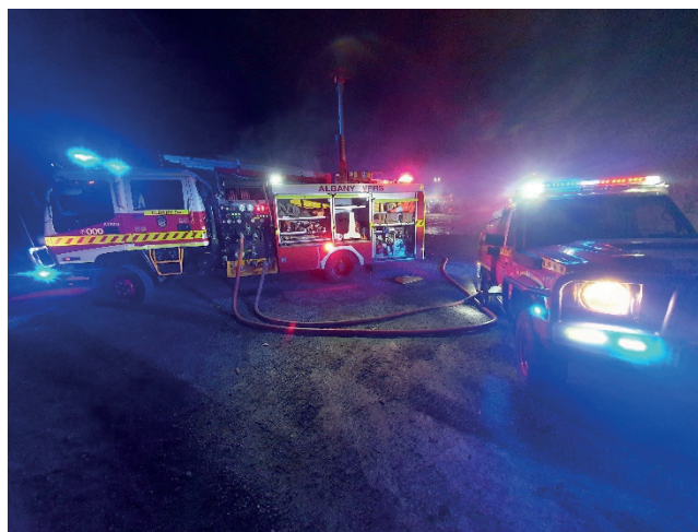
ALBANY VOLUNTEER FIRE AND RESCUE SERVICE

It is therefore appropriate for the Association to acknowledge their enormous contribution to this State's Volunteer Fire and Rescue Service Brigades and our members.