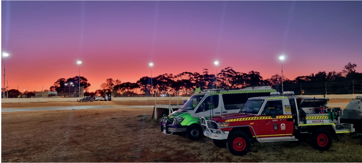
MOORA VOLUNTEER FIRE AND RESCUE SERVICE

ANNUAL REPORT YEAR ENDED 30 JUNE 2024 37