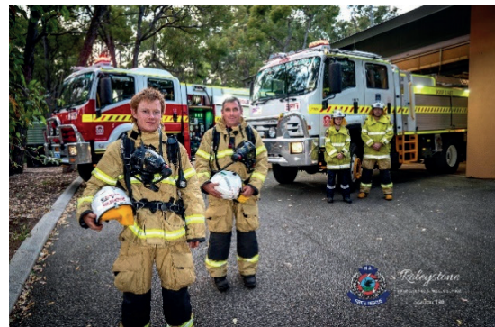
YANCHEP AND ROLEYSTONE VOLUNTEER FIRE AND RESCUE SERVICES