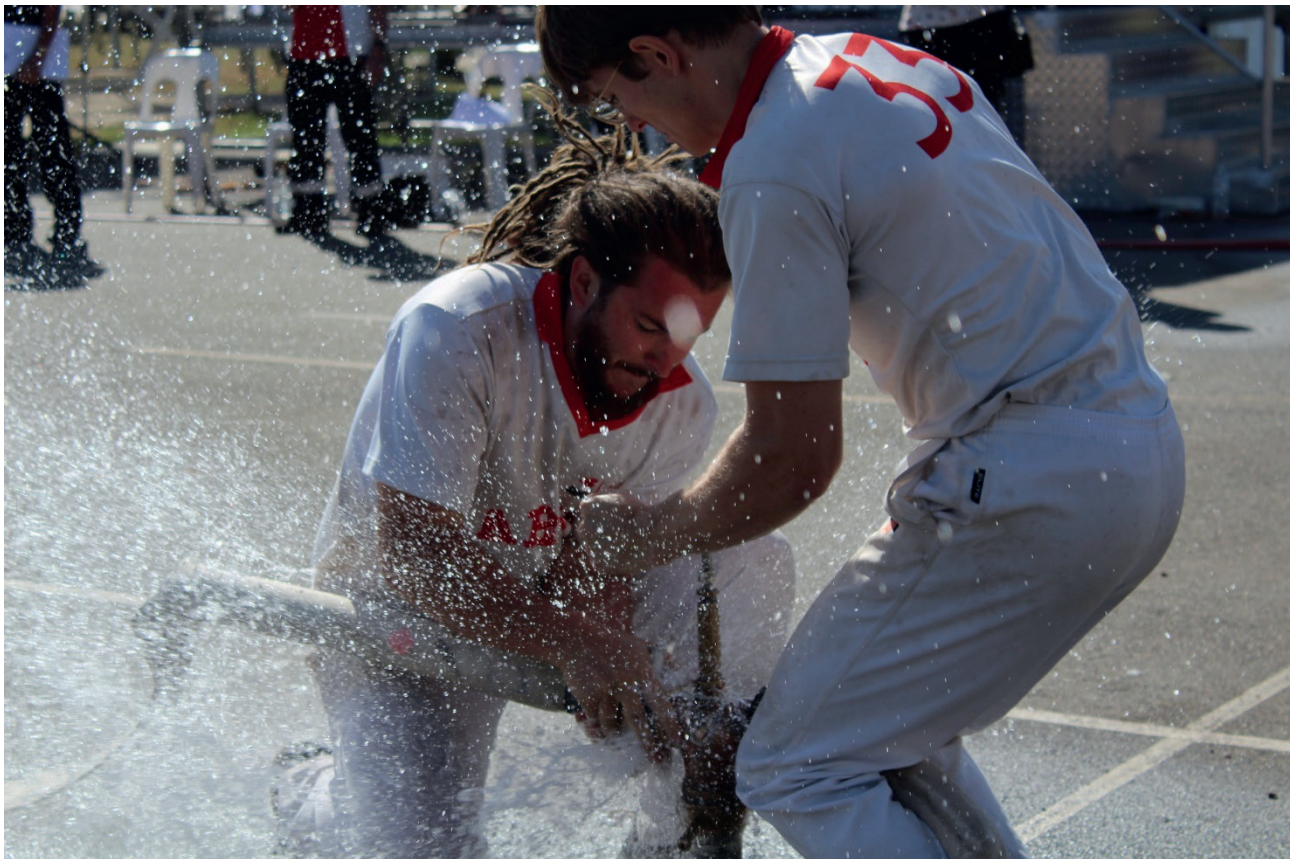
HARVEY VOLUNTEER FIRE AND RESCUE SERVICE AT THE STATE EASTER CHAMPIONSHIPS

The Association recently completed workshopping and developing the strategic plan for future years. Once this is finalised it will be approved by the Executive and distributed accordingly.