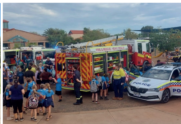
FALCON AND KARRATHA VOLUNTEER FIRE AND RESCUE SERVICES